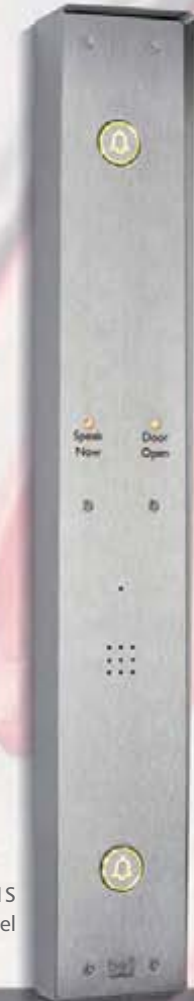
Model DDAP-EXT-1S surface panel

Convenient packaged systems are available for any combination of the above including panel, telephones, power supply and lock release. These include;