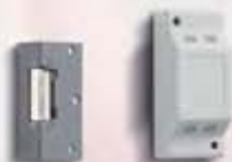
Model DDA3 3 way system