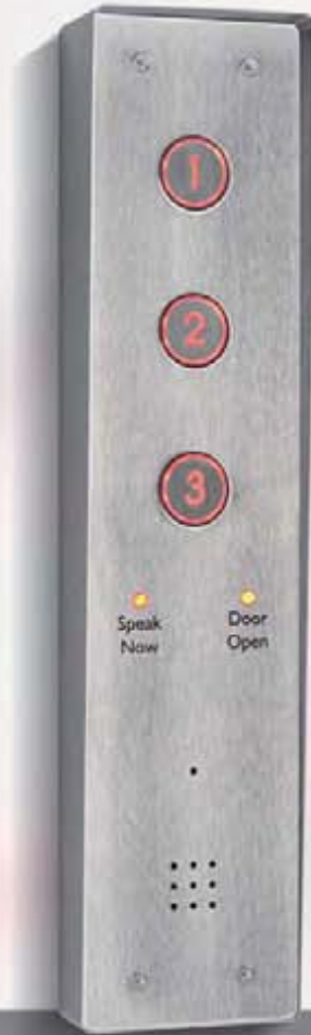
Model DDAP3-S surface panel