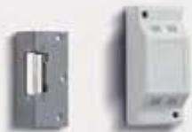
Extended Model DDA-EXT-1 1 way system