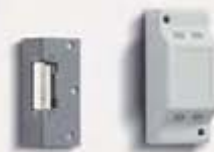
Proximity Model CSP-DDA1 1 way system