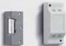
Model DDA1 1 way system