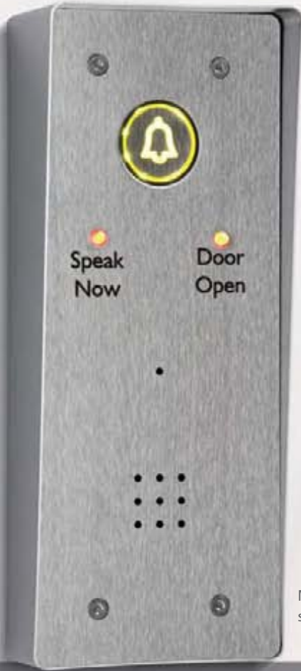
Model DDAP1-S surface panel